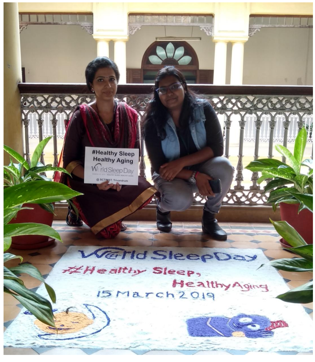
# HEALTHY SLEEP, HEALTHY AGING